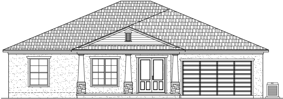
THE GAINESVILLE (59'-6"W X 60'-6"D) © COPYRIGHT TRINITY DRAFTING LLC